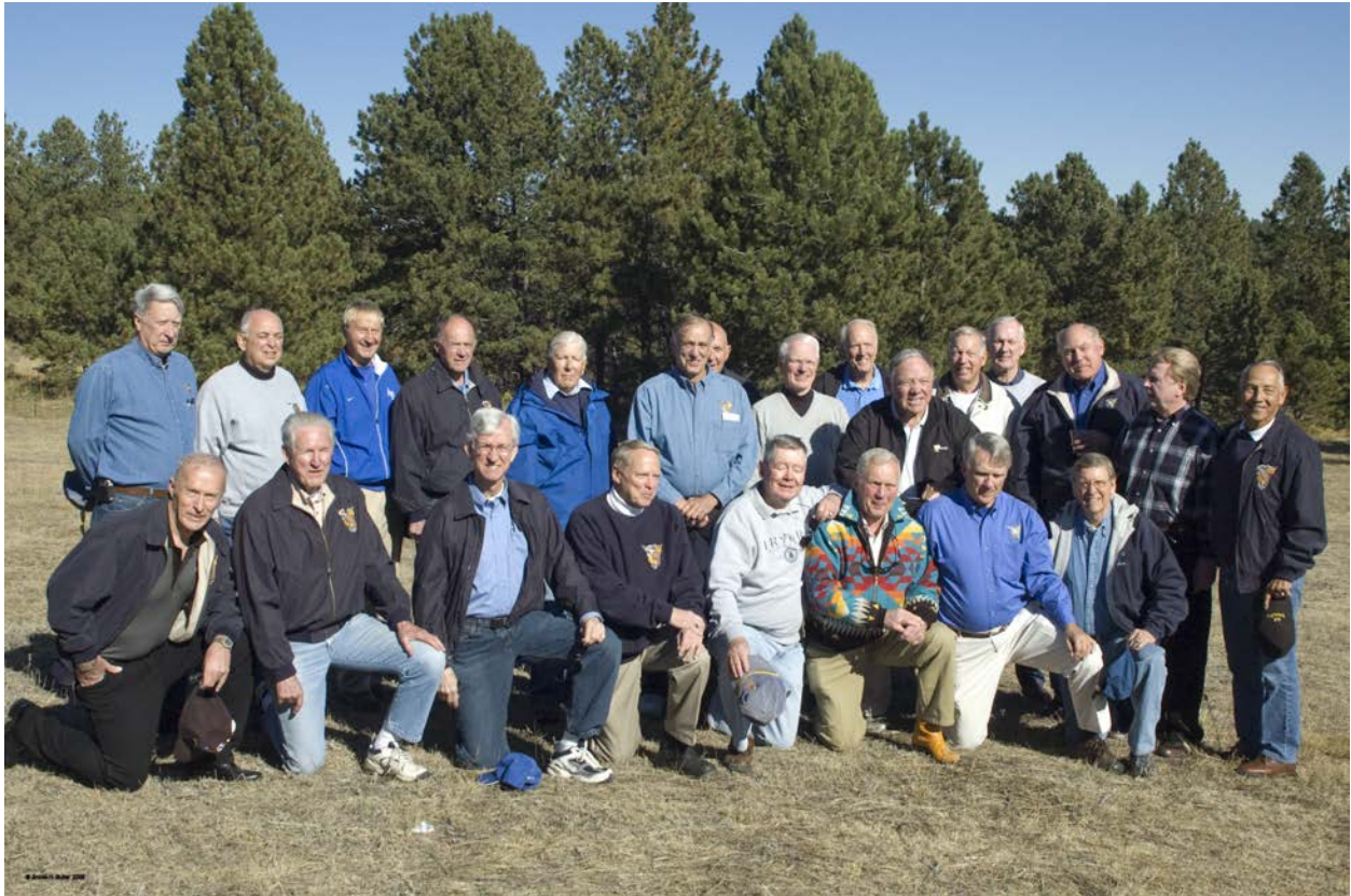
Pre game tailgate in a Falcon Stadium parking lot

Also, in the early 90's, local classmates started gathering for tailgate parties before football games, and they grew into mini-reunions as out-of-town classmates started joining the weekend.