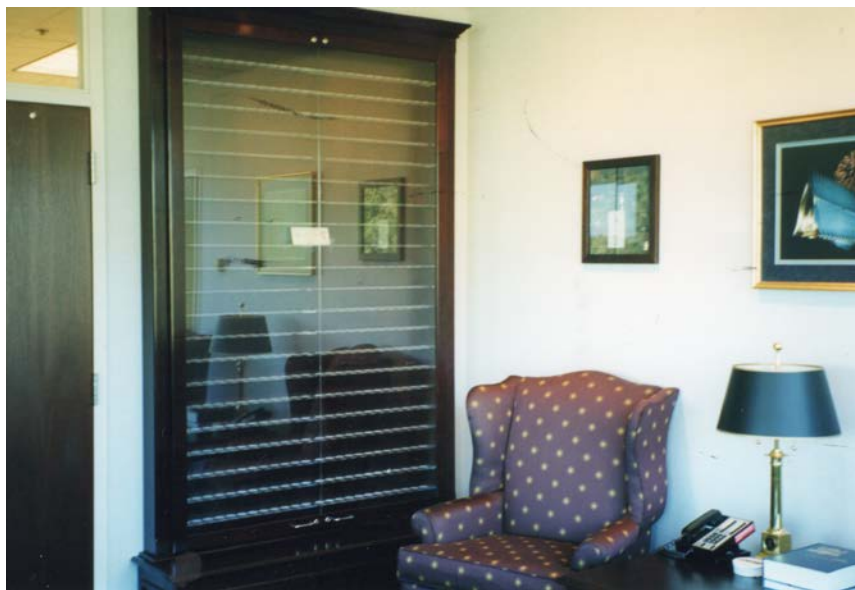
Cabinet installed in the AOG president's office, 1996