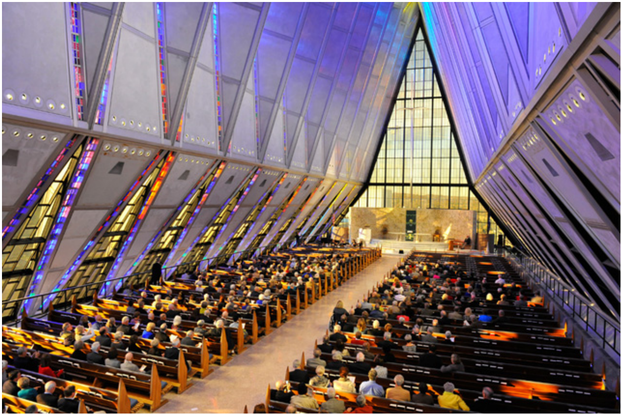
A Cup Turning Ceremony in the Cadet Chapel. For several reunions, the Cadet Chorale sang hymns, and individual members of the Chorale gave the responses to the roll call.