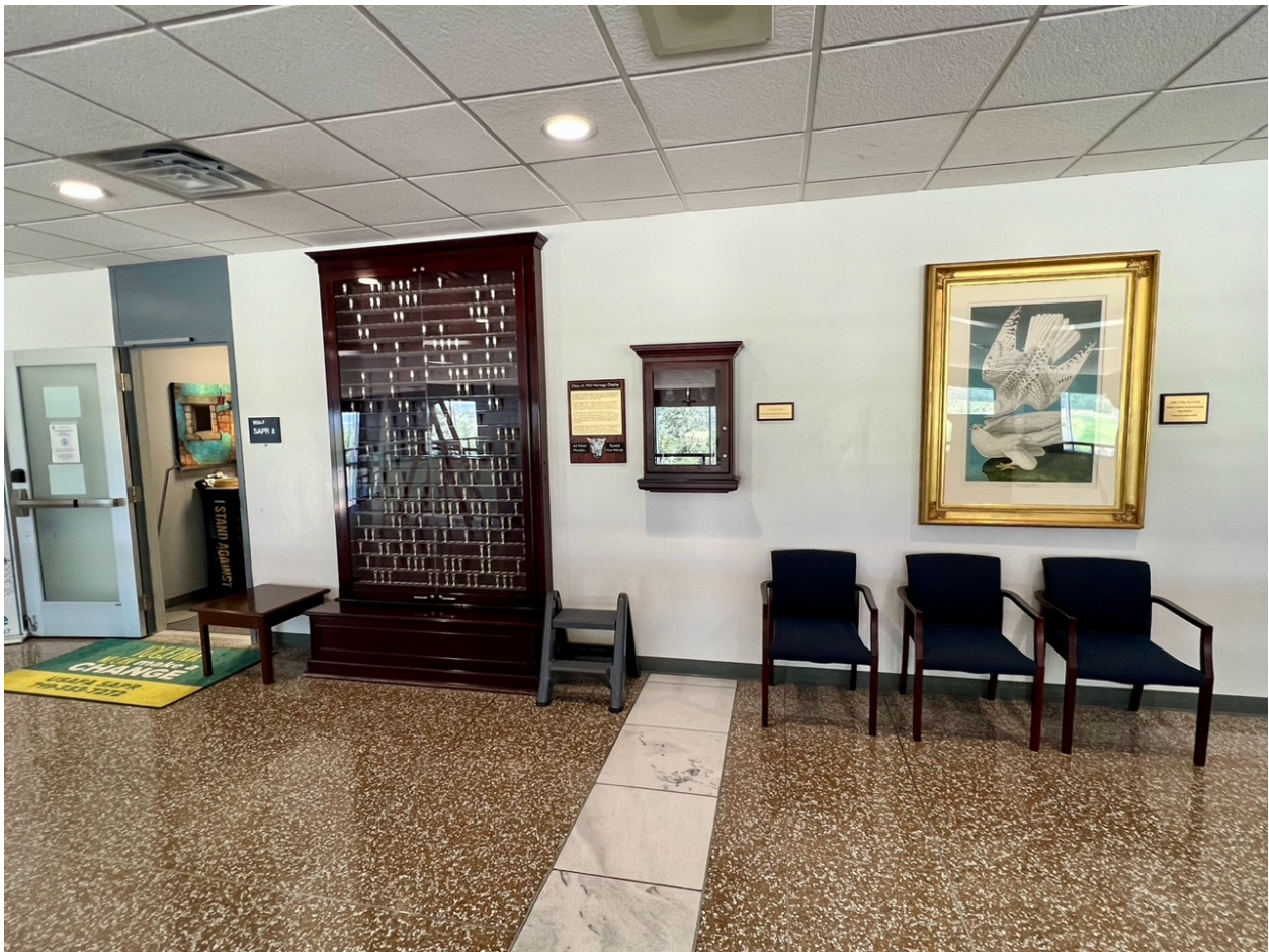
The cup display in its new home in Arnold Hall

With those details resolved, the physical move of the cabinet to Arnold Hall was completed three months later—led, again, by Jim Gaston and Doug Logue—with the help of many local classmates. The first cup turning ceremony in this new location was held during the mini reunion of 2010.